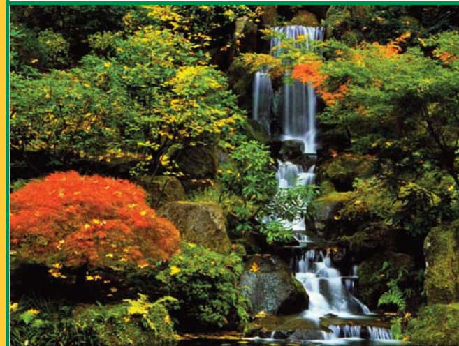
Portland's Japanese Gardens; a lovely spot to relax after the day's education session.