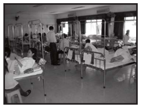
Left: Open ward in the National Obstetric and Gynecology Hospital.